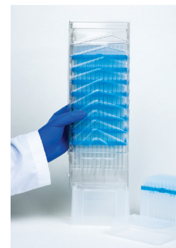
Step 4: Replace stack over empty rack base

Push down until a “click” is heard, indicating tips are locked into rack.