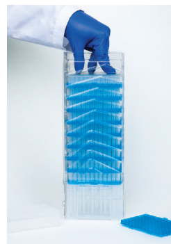
Step 3: Push down

Align and place Tip Eject over your empty Biotix rack.