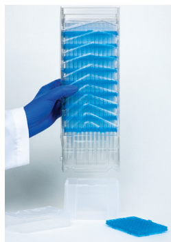
Step 2: Align empty rack

Align and place Tip Eject over your empty Biotix rack.