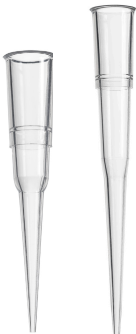
TM-0050-9RNC TM-0200-9RNC TM-0050-9RSC TM-0200-9RSC