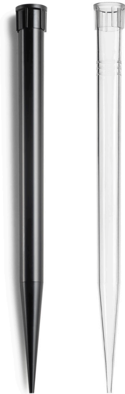
T-1000-9NB T-1000-9NC T-1000-9SB T-1000-9SC