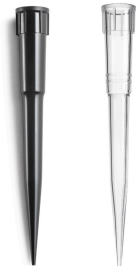
T-0200-9NB T-0200-9NC T-0200-9SB T-0200-9SC